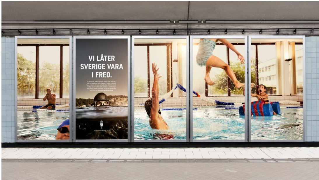
Figure 6: A billboard forming part of the campaign 'We let Sweden be at peace' in the Stockholm metro.

manner that naturalizes those threats whilst also counter-posing them to an imaginary of continued 'normality'. Consider a recent Swedish Armed Forces advertising campaign, described as follows: