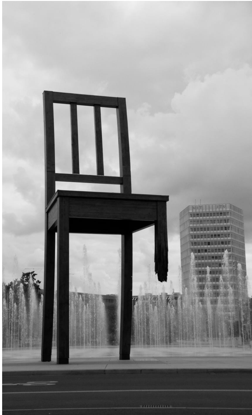
Figure 1: The Broken Chair, Daniel Berset, Place des Nations, Geneva. CC BY-NC-SA 2.0, Mike Edwards, 2008.

by local and global inequalities. This state of the sublime operates differently in Bogota and Geneva. It affects Swiss citizens and Colombian refugees in radically different ways. For many people in Catatumbo, Colombia, violence and security is a naked and exposed experience that generates paralyzing and blocking consequences for those who are poor, indigenous, black, women, or for those who queer categories of belonging. By contrast, Danish or Swiss citizens experience this state of the sublime as a spectral or haunting non-presence that is actively managed and trans-feared