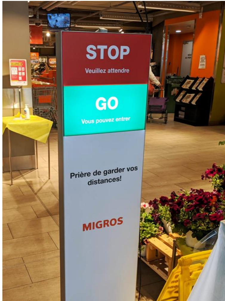
Figure 5: COVID-19 Traffic-light filtering device at a supermarket in Geneva, Switzerland.

know how to save ourselves.” Again, transfrayeurs both recall the diffuse security threats in our midst and assure us that life can go on. The contradiction between liberty, rights, and empowerment, on the one hand, and security, on the other, is manageable. COVID-19 might be the most real, genuinely sublimely overwhelming security threat that has emerged in recent history. Aesthetic protocols keep things moving anyhow. We can rest both easy and uneasy, without contradiction in the current order. Particularly as the protocol distracts and disconnects from the excluded and marginalized by the COVID-19 shopping order, as much as from those blocked by security walls. As Spivak finishes her words, less reassuringly: “the moral will should lead to the golden rule – treat others as you would like to be treated yourself. This does not emerge in the current context.” 78