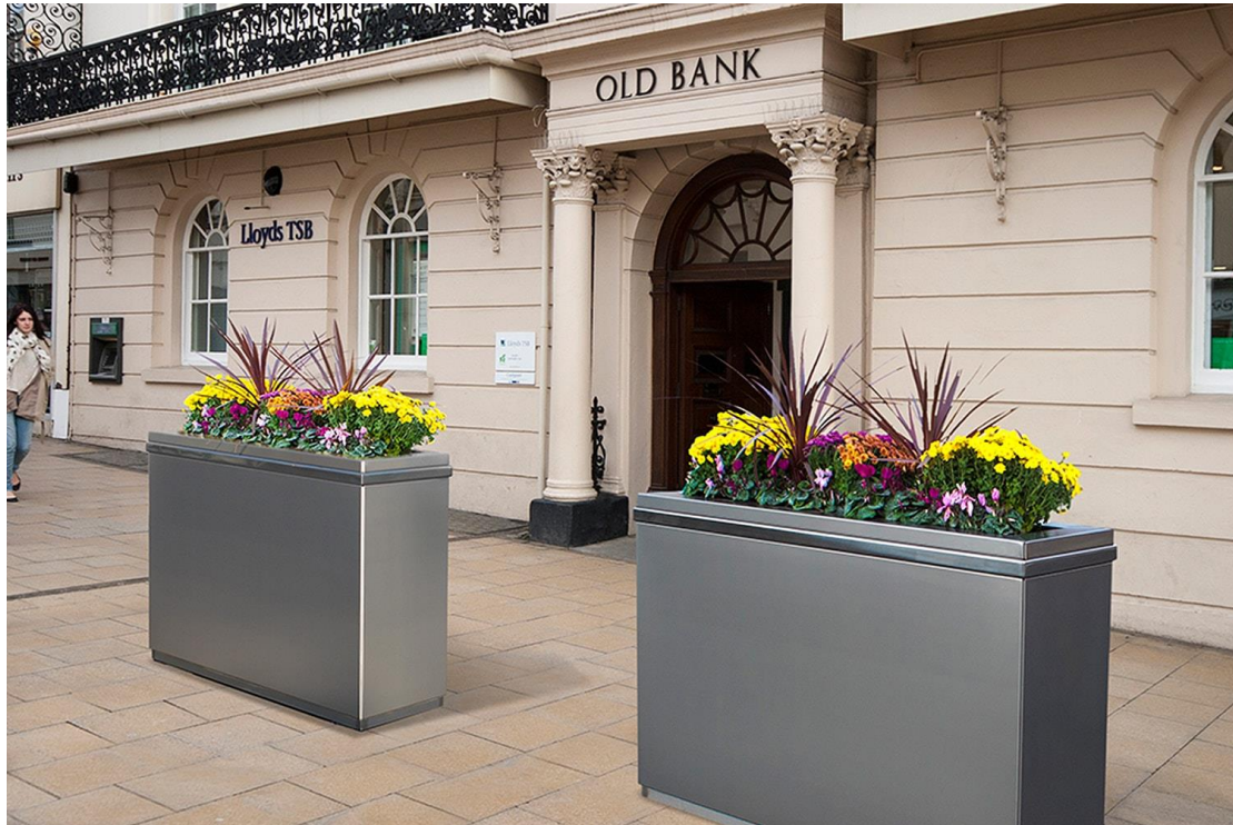
Figure 2: Protective barriers amalgamated into plant pots.

An example. Figure 2 depicts a series of over-sized plant pots designed to serve as barriers to hostile vehicles or persons (by being constructed from concrete or steel), whilst also aesthetically blending-in to the environment and/or even augmenting or improving its everyday aesthetic. One company constructing such barriers describes them as: