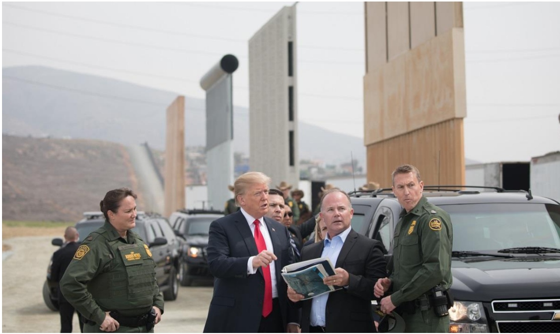
Figure 4: Former President Donald J. Trump visits prototype designs for a border wall, including two with ‘sand’ color schemes designed to blend into the desert environment.

impenetrable, non-transparent, and deterring, producing a “bureaucratic aesthetics of division” and “occupation of the senses.” 74 While such an exceptionalist aesthetics squarely imposes threat, danger, and insecurity, designs for the US border wall background it, even as it recalls exceptional politics. At least for its domestic (white US citizens) audience, its aesthetics balances a political desire to secure against migrants with the need to allow the world to continue to flow as normal. The same is true for the Israeli ‘security barrier.’ Its harsh aesthetics of separation is visible, by and large, only to Palestinians, with Israelis travelling freely across specially constructed highways from which the wall is mostly invisible (through the strategic placement of trees, overpasses, etc.).