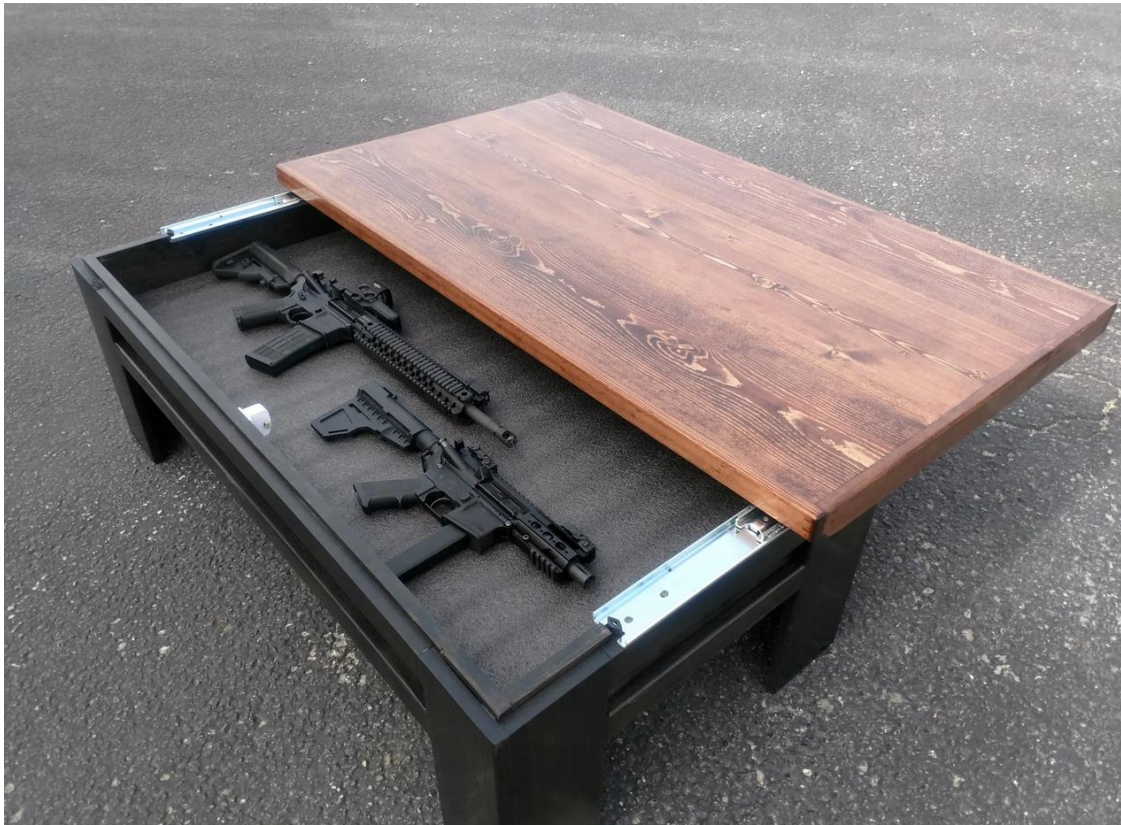
Figure 3: Gun safe amalgamated into a coffee table.

Architects and other designers are now being required to take into consideration counter-terrorism measures when designing public access buildings and public open spaces. This extends the requirement from high-risk targets to the wider environment and with it the need to deliver good design that creates a sense of security without a siege mentality . It is important that our built environment continues to reflect that we are an open and inclusive society and that in interpreting these new requirements our buildings do not convey that we are driven by security measures . 66